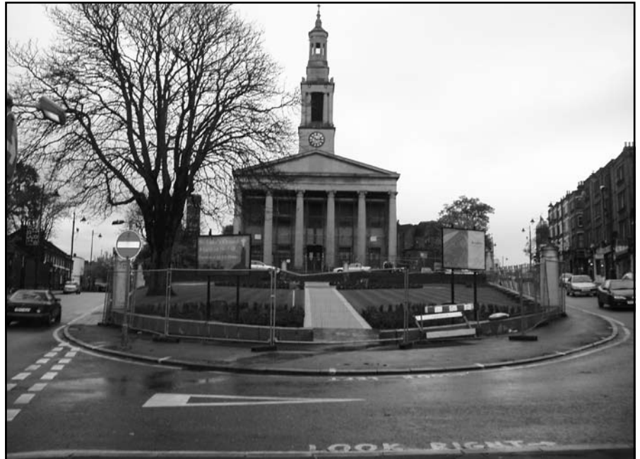
St Luke's Gardens – Norwood residents are regenerating the area.