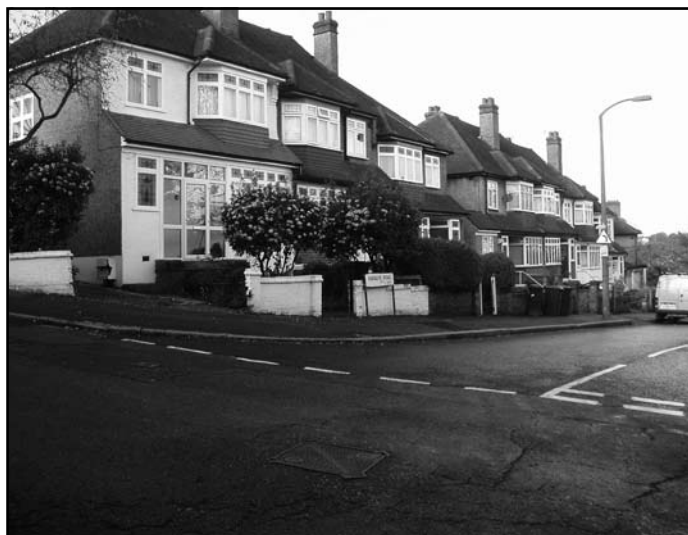
Labour's plans will harm the environment and property prices.