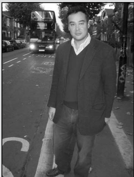
Kim - we oppose the cuts to the No. 3 service.