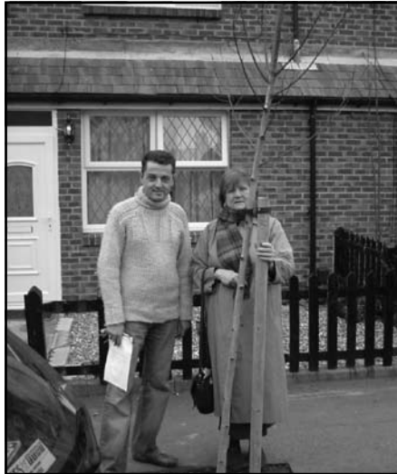
New street trees for Rommany Road.

"Street trees look great, but if they are not properly maintained, they can be a nightmare for property owners," says Russell. "At last Lambeth is taking its responsibilities seriously and promising to look after its trees".