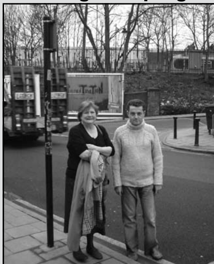
After 6 years of campaigning, consultation is about to begin for a new crossing.

"This is fantastic news," says Janet. "It means that local residents will be able to cross safely when going to and from West Norwood Station. At present you take your life in your hands when you cross Norwood High Street and we have been campaigning for a crossing for a very long time".