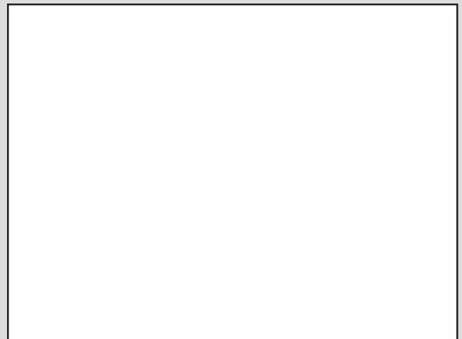
Work on the park has started.

The next stage must be to update the dilapidated red-gra pitch, which needs new fencing, a new surface and a net to stop balls from being kicked into neighbouring gardens. In the recent consultation exercise, residents made it clear that they wanted the pitch to be multi-use and local councillors are pressing the Council to make this a reality.